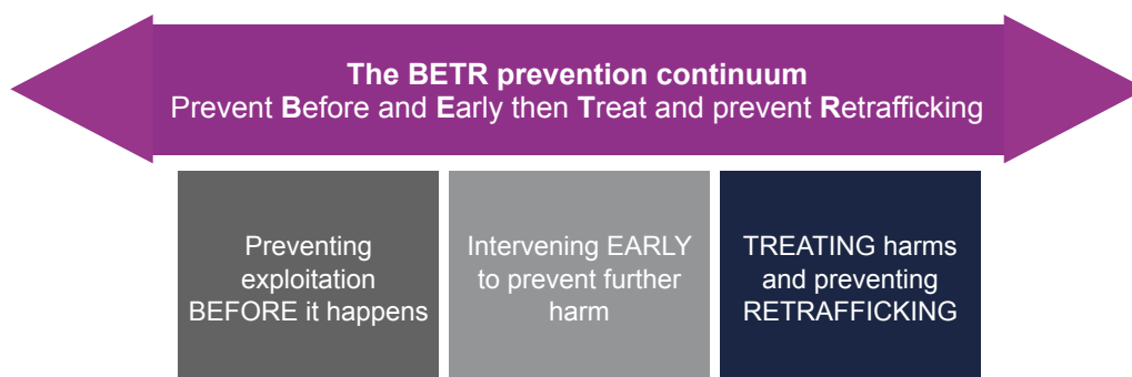
Figure 1: BETR Prevention Continuum

Figure shows the ‘Before, Early, Treat and Preventing Re-trafficking’ framework and its relations between prevention, intervention and treatment (Such et al., 2022: 8).