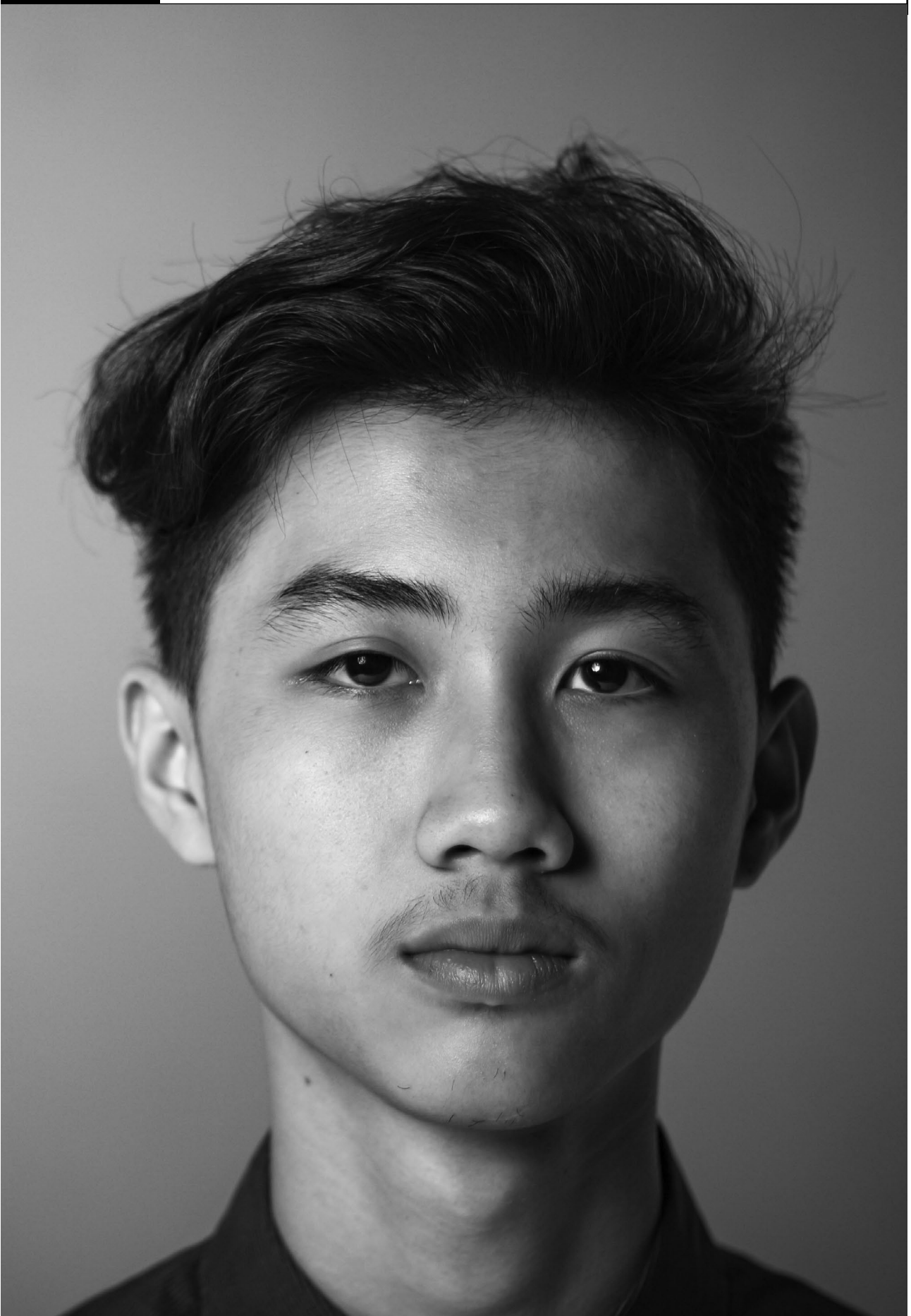
This image is a stock photo used for illustrative purposes only. No child victim is depicted in this report.